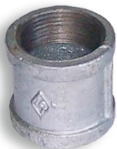
Sockets – Equal