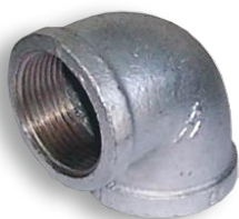
Elbows 90° Female x Female