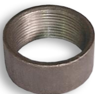
Sockets – Half